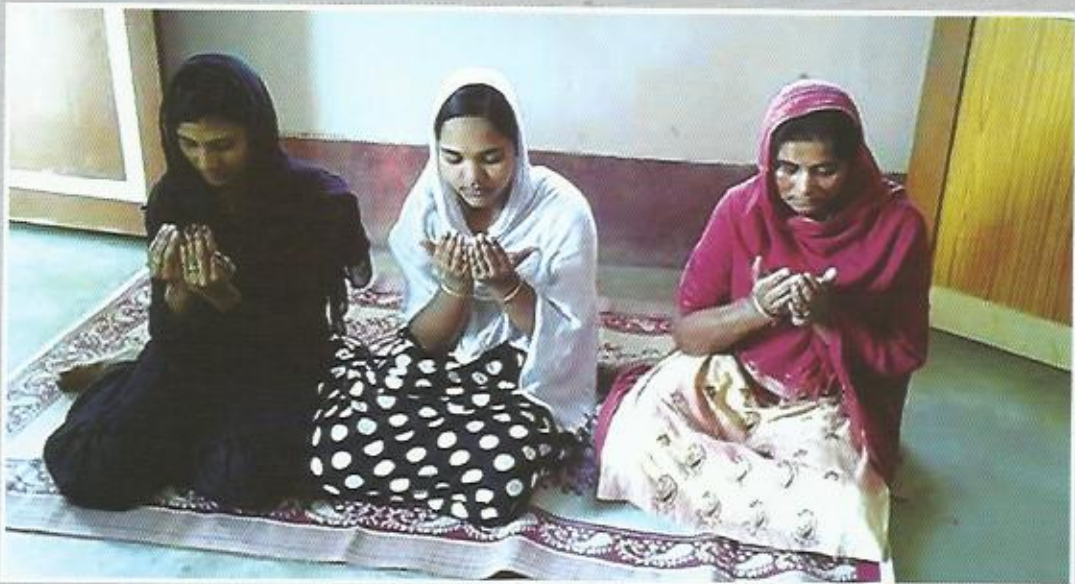
MUSLIM INMATES OF OUR SHORT STAY HOME OBSERVED ROJA (UPABAS) AND PRAYED FOR PEACE AND HARMONY ON THE AUSPICIOUS DAY OF DIWALI