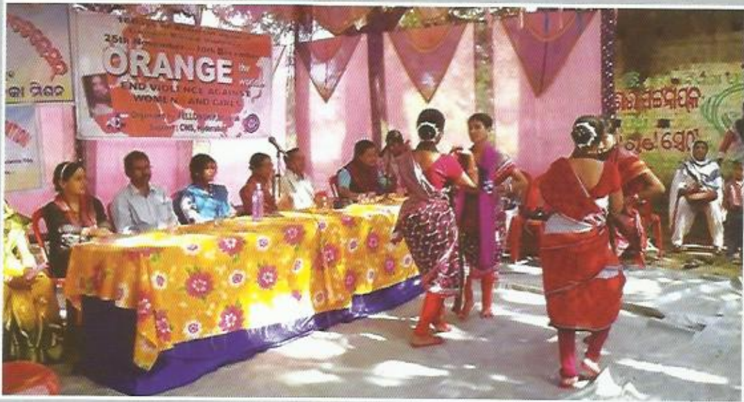
SURVIVORS OF TRAFFICKING GIRLS PERFORMING DANCE IN THE AWARENESS PROGRAMME